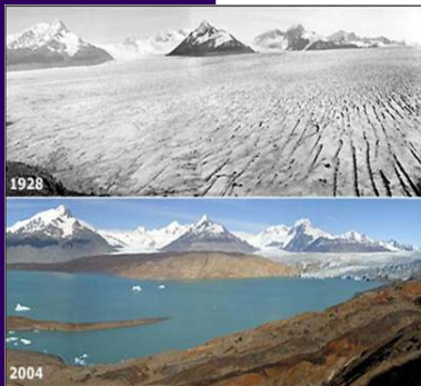
Upsala Glacier, Argentina

We are becoming accustomed to reports of extreme weather events, declining species, and record temperatures. A 2009 report by Oxfam suggested that 26 million people had already been displaced as a result of climate change ( www.oxfam.org ). As much as a scientific theory can be proven, climate change and mankind's