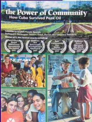
First film... Cuba's experience

The Kyneton Transition Hub's first film session will be on Sunday 18th September from 5 - 7 pm.